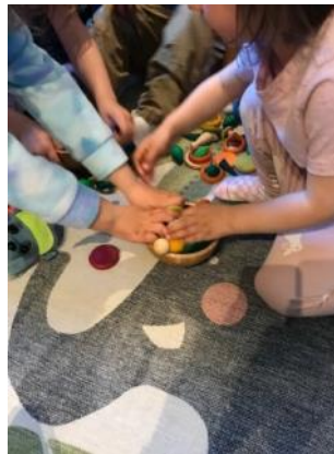
Serendipity Child Care in Madeira Park