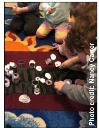
Noah's Ark Licensed Family Child Care in Gibsons