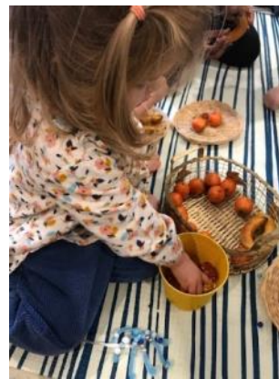
Munchkin Land Licensed Family Child Care in Gibsons